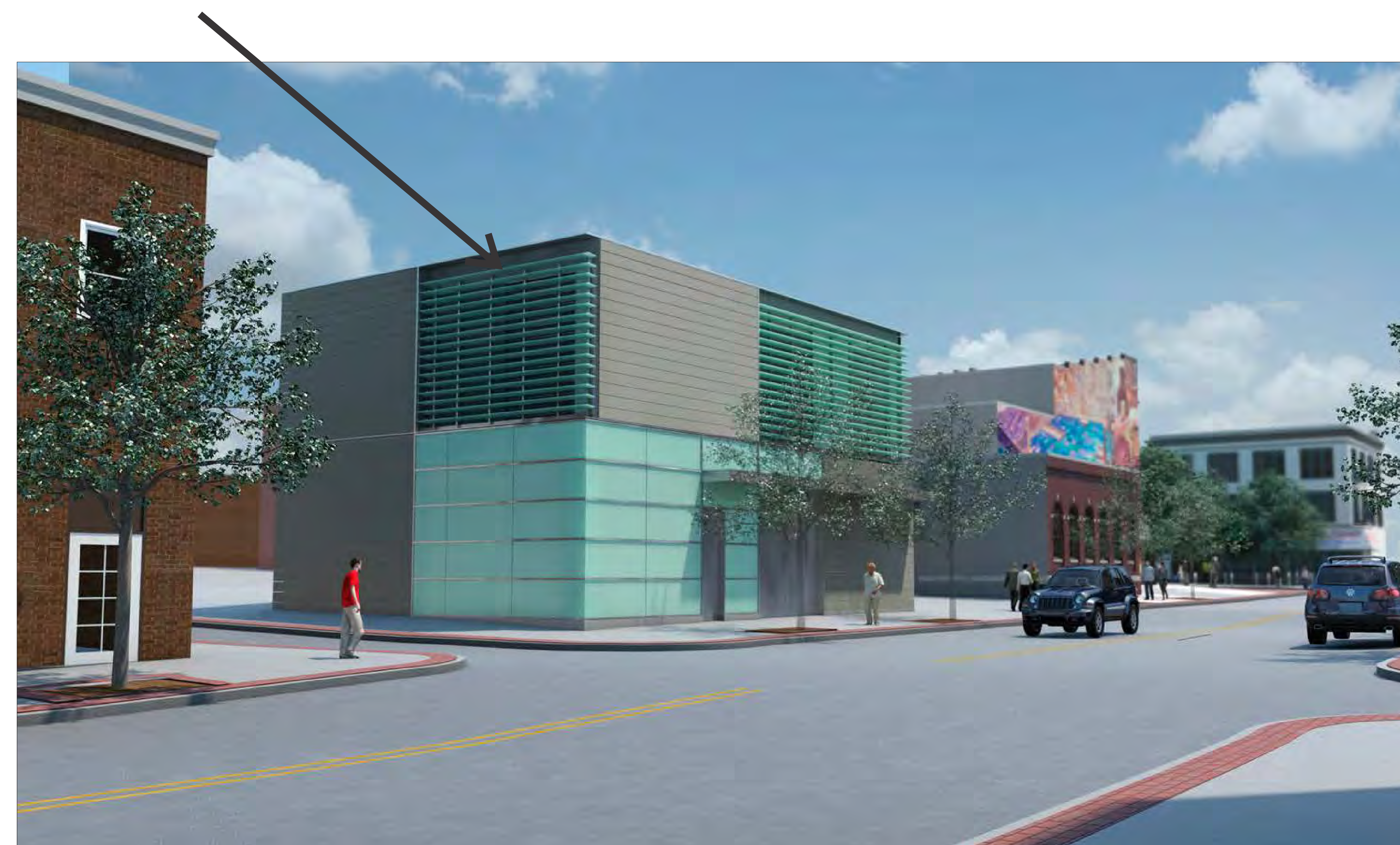
Red Line Ventilation Shaft Rendering, Fells Point